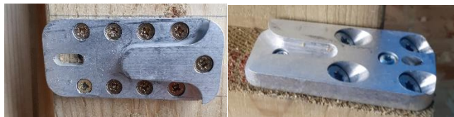
Fig. 1 Connector to enable the dismantling of the wooden structure (0,14kg aluminium + 0,78kg galvanised steel screws per connector). One connector is needed for each 38x100mm beam connection, two connectors are needed for each 38x200 mm beam connection.

conventional wooden skeleton module; (2) evaluate the impact (or benefit) of using aluminium connectors ( Fig. 1 ) instead of screws, to ease the dismantling of the structure for reuse; (3) identify major sources of impact and make recommendations for optimisation.